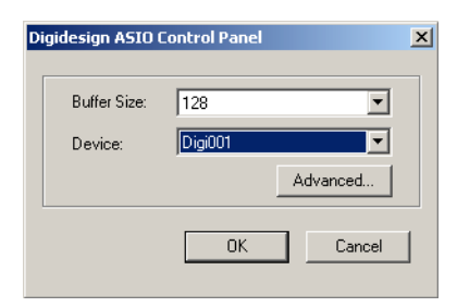
Digidesign ASIO Control Panel

From the ASIO Driver Control Panel, you can configure the ASIO Driver for your Pro Tools system.