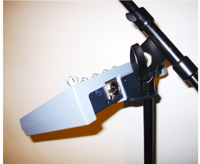
PQ Controller affixed to a microphone mount

3 Affix the PQ Controller mounting bracket to any standard microphone mount, and secure it with a nut or with a microphone boom (shown below).